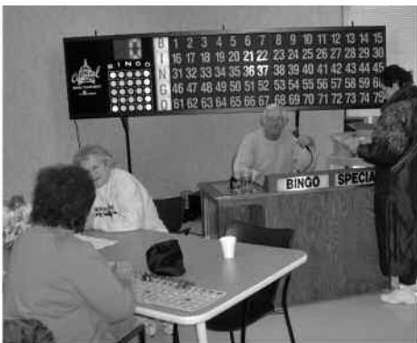
Senior citizens enjoy a game of Bingo.