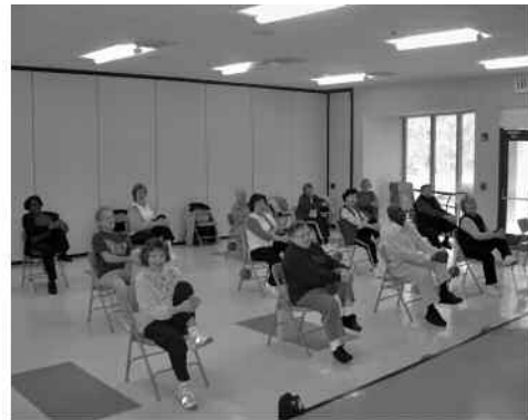
Senior citizens work out in one of the daily exercise classes.