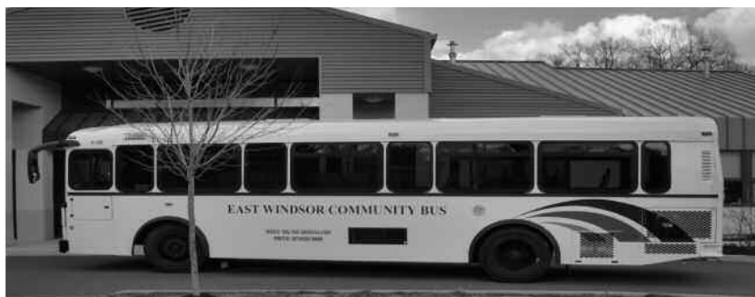
The new East Windsor Township Community Bus drops off senior citizens at the Senior Center each day.

East Windsor Township was awarded a new Community Bus from New Jersey Transit through a Federal Transit Administration grant. There was significant competition for this program funding, but the Mayor and Council succeeded in obtaining a $156,085 grant for purchase of a new 2008 bus, at no cost to the Township. The new 34 foot long bus replaces a ten year old bus and can accommodate 30 passengers. It is equipped with a platform type wheel chair lift, a kneeling feature to assist handicapped riders, package racks, air-conditioning, seat belts, arm rests and emergency pull cords. The Community Bus is used to transport Township residents to and from the East Windsor Township Senior Center, shopping centers and medical appointments. The bus operates Monday through Friday and the second Saturday of each month. Any resident wishing to use the bus should contact the East Windsor Township Senior Center to schedule a pick-up time at 371-7192.